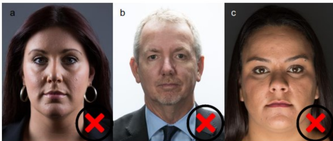
Non-compliant portraits: a) Side illumination, b) Top illumination, c) Bottom illumination.