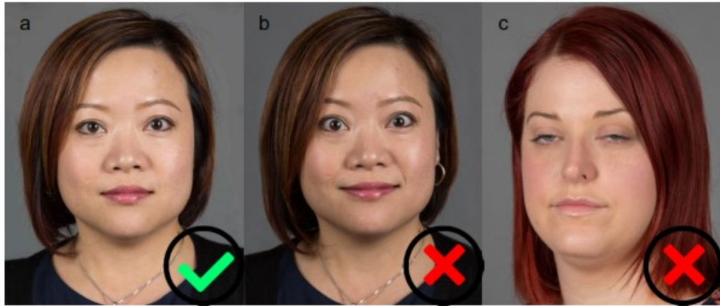
a) Compliant portrait, b) Unnaturally wide opened eyes, c) Eyes not fully opened.