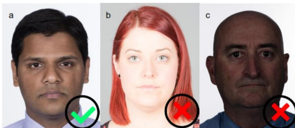
a) Compliant portrait, b) Over exposure, c) Under exposure.