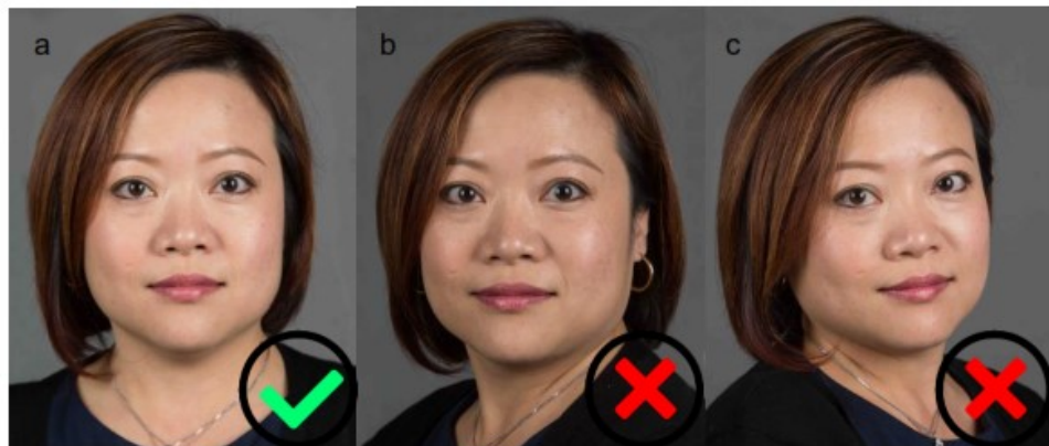
a) Compliant portrait, b) Shoulders not aligned toward the camera, c) Shoulders not aligned toward the camera, head tipped to the side.