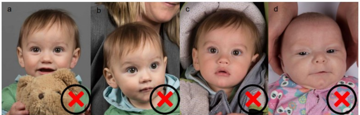
a) Toy, b) supporting person, c) Non-neutral background, d) Supporting hands.