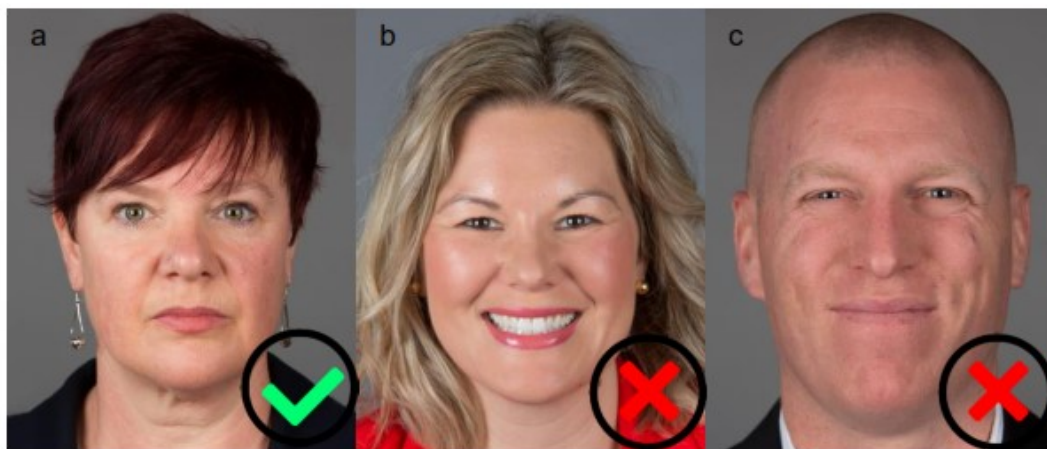
a) Compliant portrait, b) Smiling person, c) Person smiling with closed mouth.